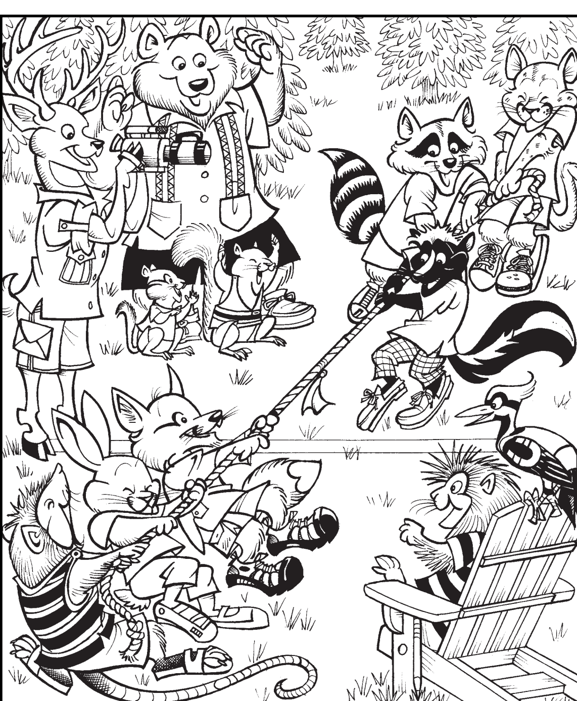
In this big picture, find the heart, hamburger, shovel, ladder, screw, tea bag, banana, ladle, muq, worm, drinking straw, wrench, and funnel.