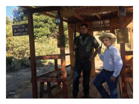
The Order of the Arrow Wiatava Lodge donated the new cowboy action shooting range.