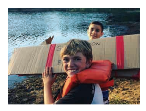
Lake Virginia was full for the first summer since 2011!

in 2017, the program at Lost Valley was second to none! New activities and adventures combined with traditional Scout programming made for a summer to remember. Some of the highlights include: