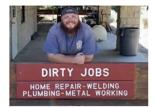
Dirty Jobs was introduced and was a big hit among both Scouts and leaders!