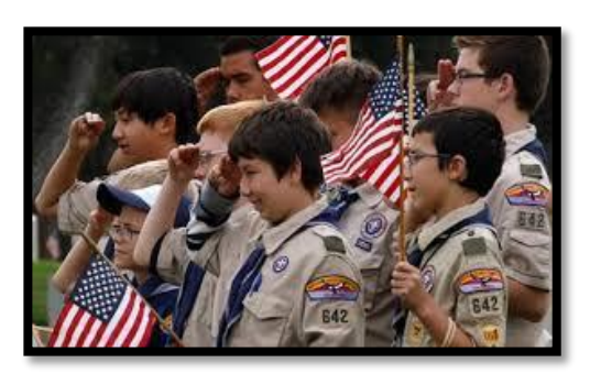
Your gift multiplied!